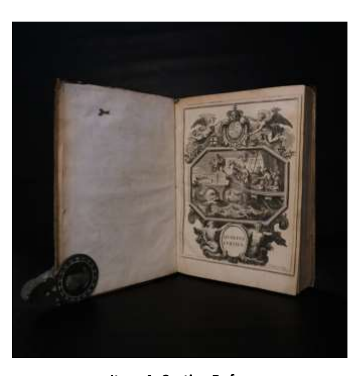
Item 4: Curtius Rufus